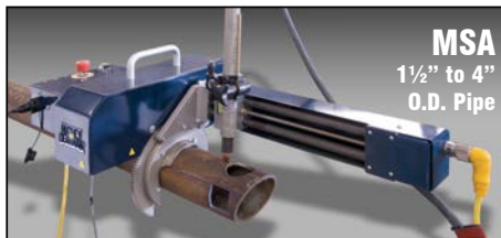
MSA 1½" to 4" O.D. Pipe