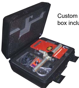
Custom storage box included