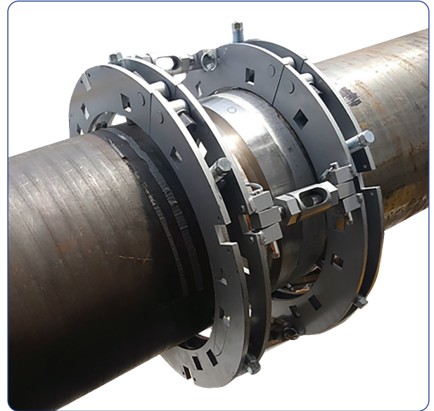
MATHEY DEARMAN SUPER CLAMP - HD

Align, Reform AND SET THE WELD GAP with a few turns of a wrench